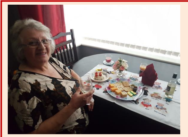
Table Decoration Award