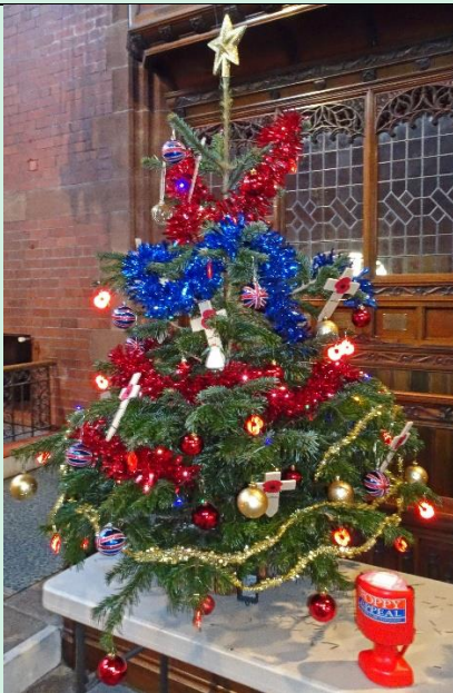
Poppy Appeal Royal British Legion www.britishlegion.org