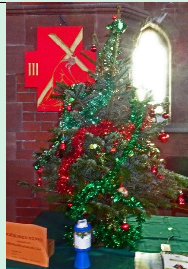
Woodlands Hospice Sponsored by Brooklands Bowling Club