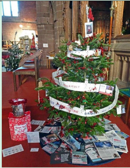
Taking Action for Palestine Medical Aid for Palestine Working for the Health and Dignity of Palestinians www.map.org.uk