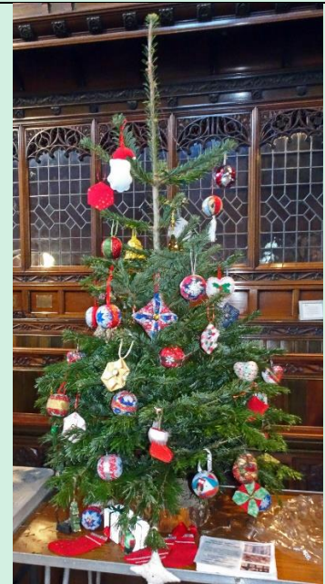
Waterloo Quilters www.waterlooquilters.com