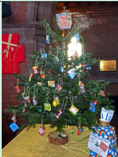
South Sefton Food Bank