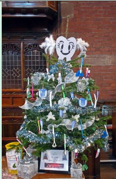
The Dentis Tree by Waterloo Dental Centre National Trust Plant a Tree Charity