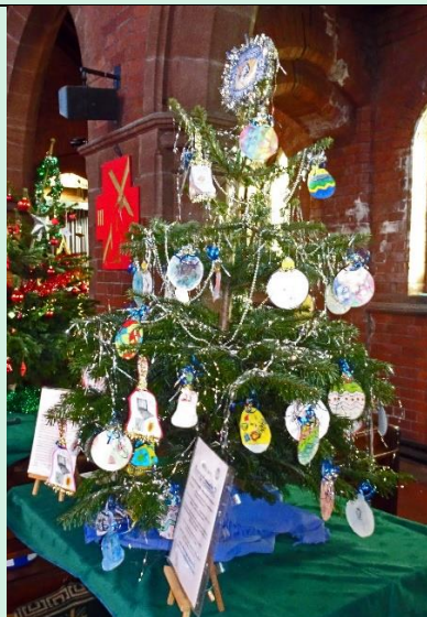
Waterloo Primary School