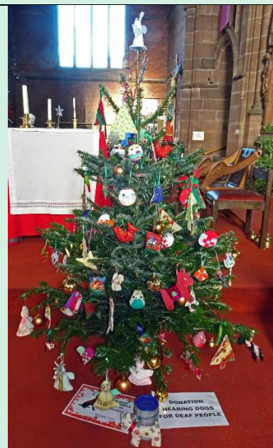
Hearing Dogs for Deaf People