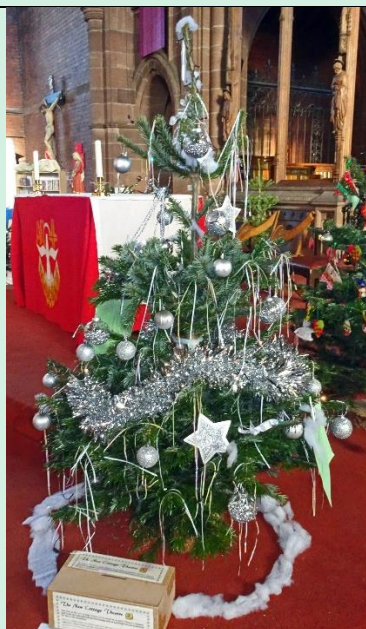
New Cottage Theatre Aim to create an inclusive Theatre Company and to advance education in the performing arts