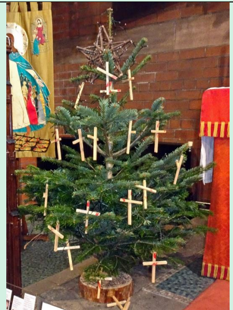
Barnabus Aid Bringing Aid to Christians around the World. The crosses on the tree remind us of thousands of Christians murdered every year for their faith